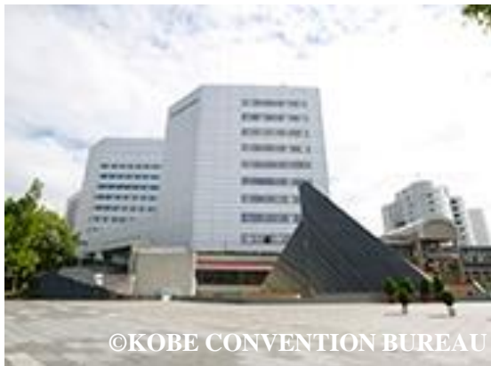
International Conference Center

KOBE Convention Center, Kobe city, Hyogo pref, Japan